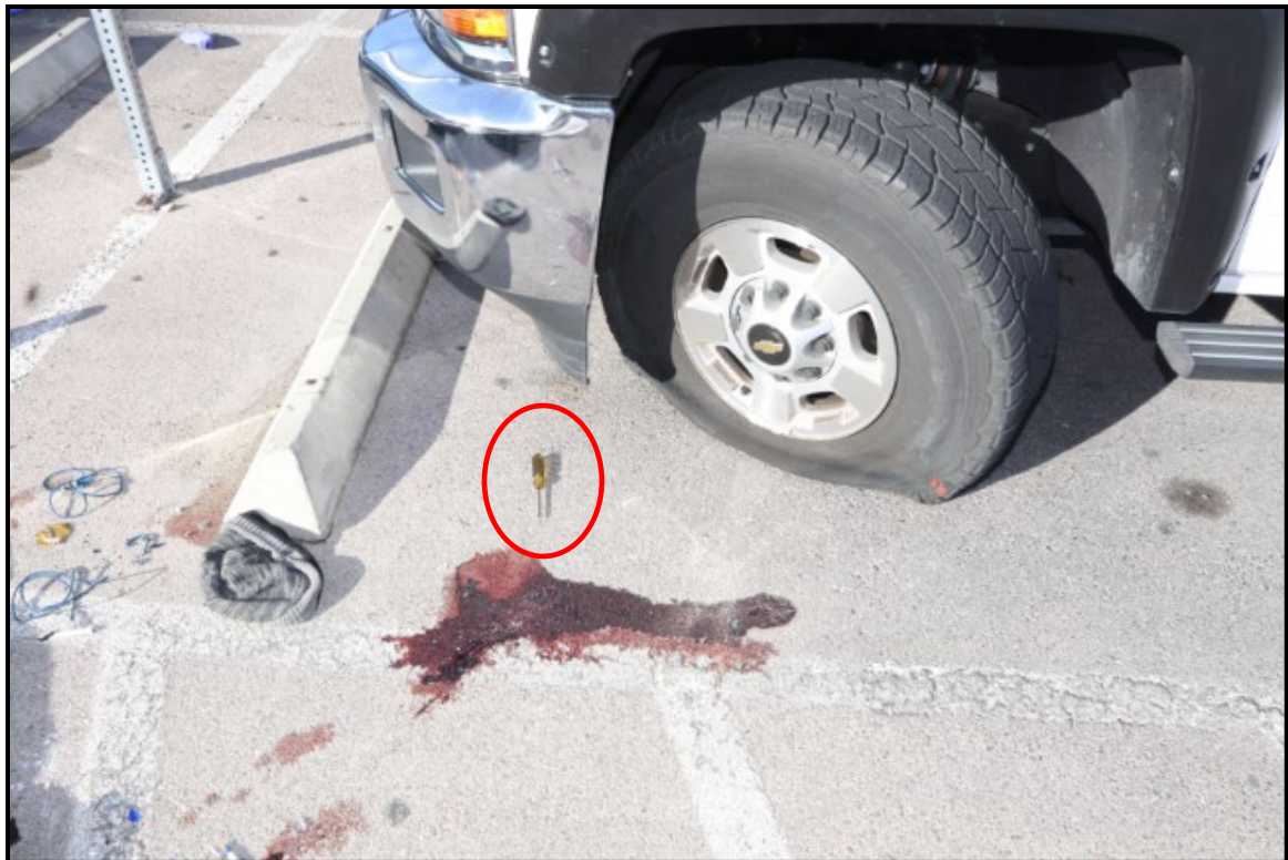
Screwdriver used by Decedent