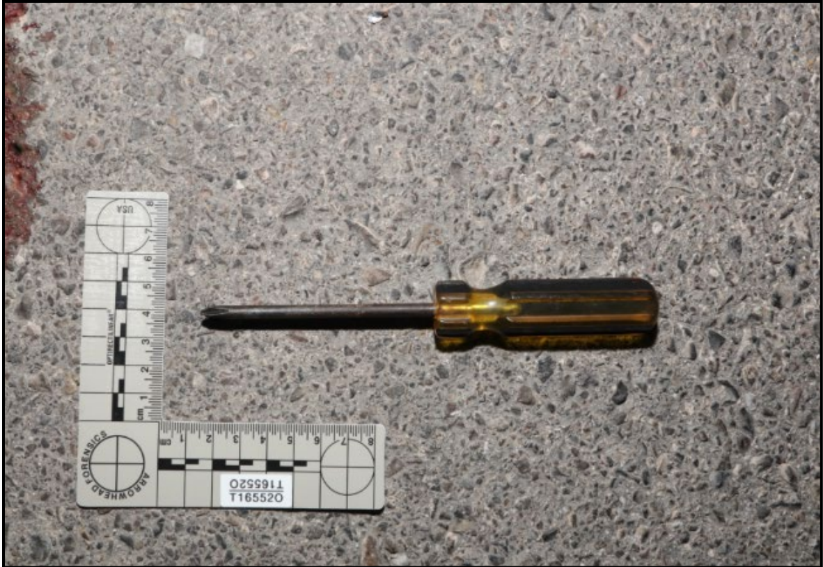
Decedent's screwdriver with scale.