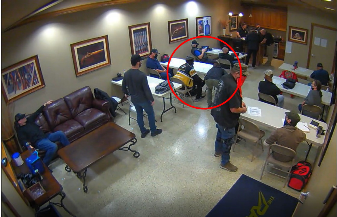
Screen Shot Showing the Owner of the Bag Attempting to Stop Decedent

After leaving the VIP Suite, Decedent was contained to an area in the southwest corner of the retail lobby. Decedent was surrounded by several employees who kept a short distance from him; he was not physically restrained. Decedent remained in that general area with employees for approximately 40 minutes until he was escorted outside of the business. During this time, Decedent showed The Range 702 employees his Nevada ID card which was photographed and returned to him.